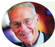
John Pepper, former CEO, Procter & Gamble

“In business, we rarely have the luxury of making an investment decision with as much evidence as we have to support the economic value of investing in early childhood development and education... Put bluntly, in my terms, they are a financial no-brainer. The only question is ‘how strong is the ROI?’ The answer: Two or three or more to one.”